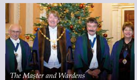
The Master and Wardens

It only remains for me to wish you all a happy, and hopefully more Covid-free, New Year in 2022!