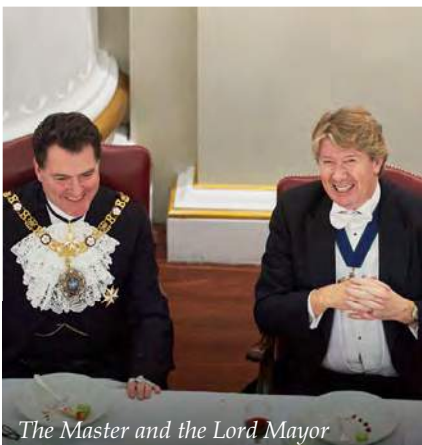
The Master and the Lord Mayor

The Master closed his speech by wishing one and all a safe, but also joyful, happy Christmas and asked us to stand for one more toast – the Marketors!