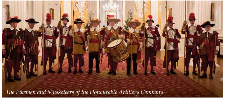
The Pikemen and Musketeers of the Honourable Artillery Company

The Lord Mayor then thanked us for coming to his home and spoke of how many good memories he had of the Marketors over the years, congratulating the Master for his