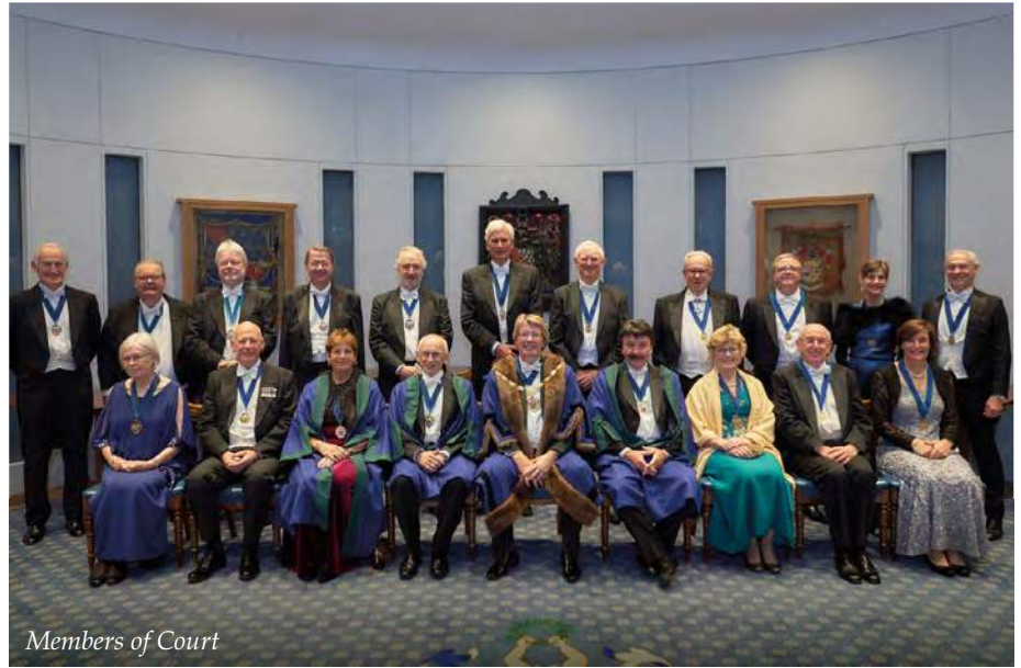
Members of Court

I very much look forward to making a difference and am proud to be a part of the Marketors.