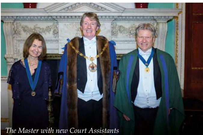
The Master with new Court Assistants