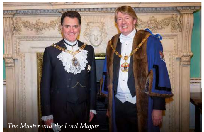
The Master and the Lord Mayor