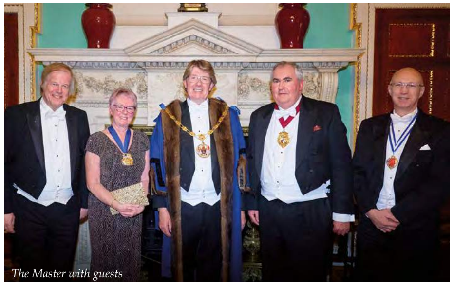
The Master with guests