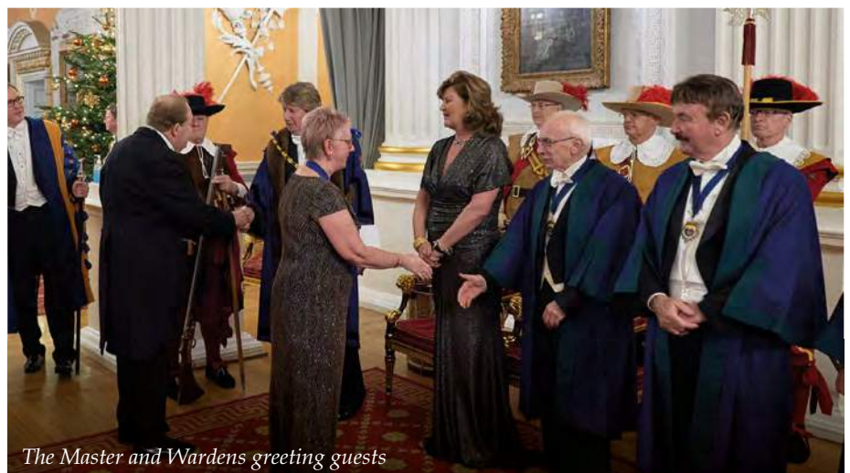
The Master and Wardens greeting guests