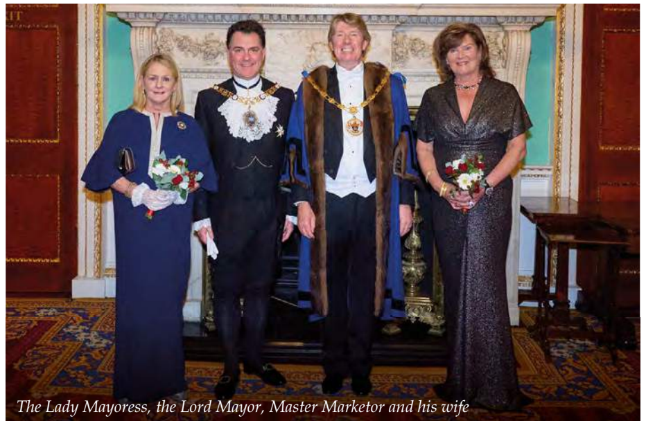
The Lady Mayoress, the Lord Mayor, Master Marketor and his wife